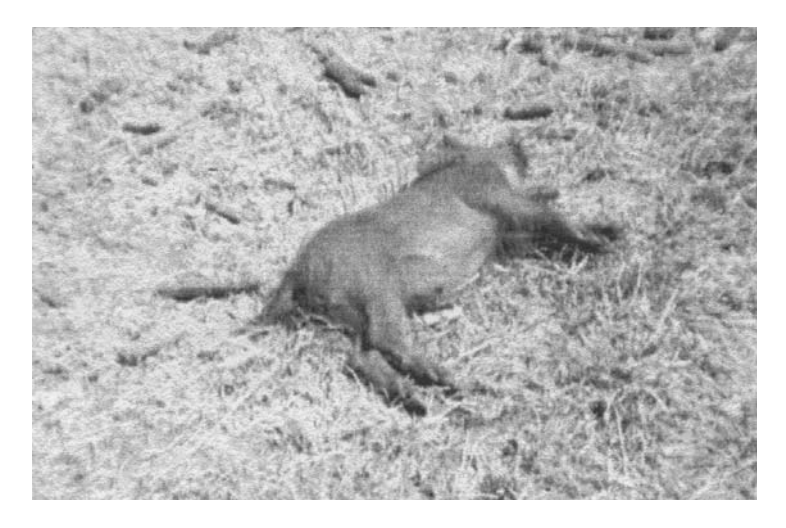
Figure 1. Halothane anaesthesia in wild pig

Close correlation between the halothane response and allelic genes distributed within calcium release channel gene was evidenced by McLennan and Phillips (1992), O'Brien et al. (1993), Schmolzl (1993) and Vogeli et al. (1994). Mutation at nt 1843 is a causative agent for substitution of arginine 615 with cysteine in the sequence of skeletal muscle calcium release channel protein in commercial pig breeds (Vogeli et al. , 1994, Sarač et al. , 1996). Linkage analyses indicated RYR1 gene as a candidate gene for Hal in pigs.