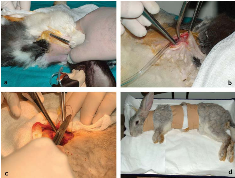
Figure 1. Surgical technique of peritoneal catheter placement-1 a. Advancing stylet through the tunnel to the exit site between the ears; b. Placement of the peritoneal catheter; c. Closing the wound; d. Securing the entrance and exit site of the catheter

could not be shortened since they had an original extension for attaching infusion systems on their exit end.