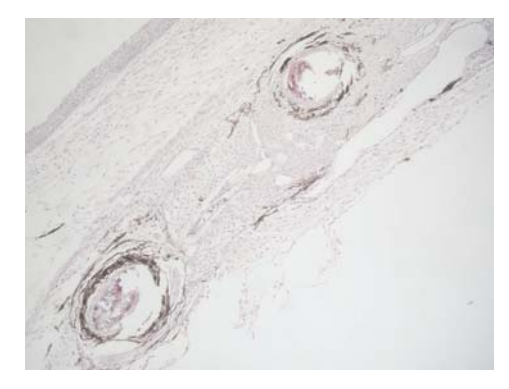
Figure 3. Ctenopharyngodon idella: transversal section of the fin infected with Posthodiplostomum cuticola metacercaria (HE, x200)

The diagnosis was confirmed by microscopic examination of suspected tissue samples identifying P. cuticula metacercaria surrounded by melanin deposits (Figures 3 and 4).