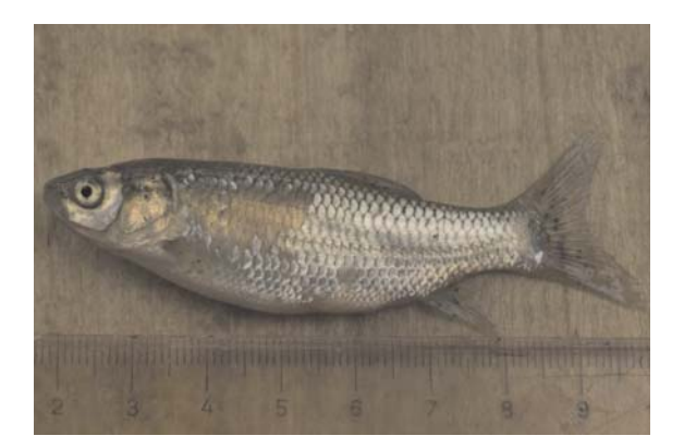
Figure 1. Young grass carp ( Ctenopharyngodon idella ) with Posthodiplostomum cuticola infection

Posthodiplostomatosis was diagnosed on the fishfarm in Susek, located in the southwest of Vojvodina (45 13' 27"N, 19 31' 57"E).