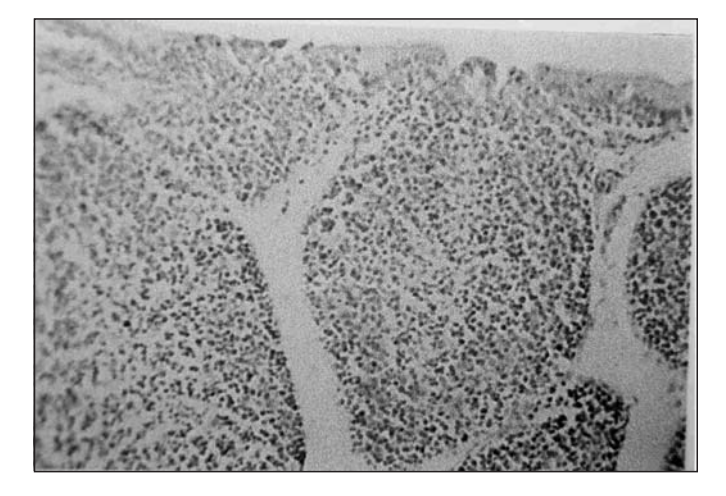
Figure 2. Chicken bursa of Fabricius, 7 days after infection showing expression of CD_3 , DP, 20X

Six days following the infection, there was a reduction of the number of immunoreactive cells. The remaining cells were mostly localized in the corticomedullary region of the follicles. In specific follicles, these cells were observed in the cortex, in equal number to the number of cells localized in the central and