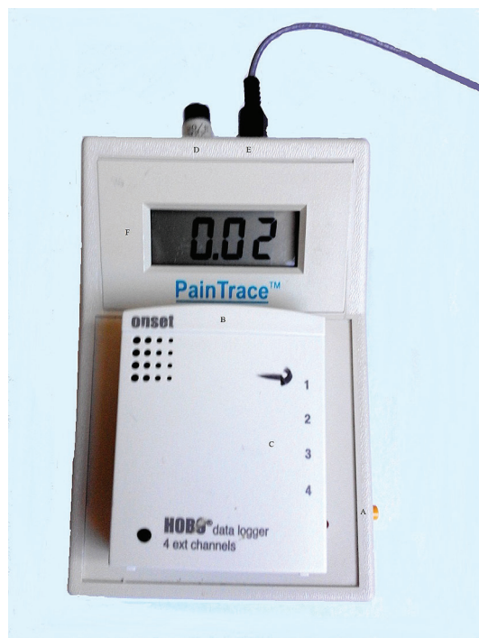
Figure 1. The Pain Trace™ device: A-on/off button; B-hobo data logger-box; C- four ports for connecting the logger to the device; D-amplifier port; E-cable port; F-display.

Skin potential measurements were taken using the Pain Trace™ device (Model 103A, Biographs Inc, Bayville, NY, USA) (Fig. 1). The unit allows skin surface voltage recordings in a manner similar to an electrocardiograph. In the dogs, SP was recorded in the neck, axilla, and chest. No detergent or alcohol was used to clean the electrode sites before attachment. In cases where the skin was dirty, the area was cleaned with water and air dried. A disposable Ag/AgCl ECG electrode (Blue Sensor ECG Electrodes Water Gel, Ambu, Cambridgeshire, UK) with saline conductive gel pre-applied by the manufacturer and equipped with a self-adhesive collar was applied to the hairless area. In the human subjects, the hands were washed before the experiment in order to remove skin oils and create better electrical contact, and dried using disposable towels. The measurements were made by applying the self-adhesive electrodes to the center of the palmar surface in each hand. The subjects remained in a relaxed/comfortable position.