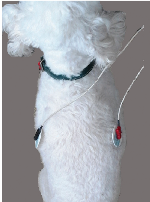
Figure 2. Example of electrode placement for skin potential reading in a dog (thorax).

The recording was started after a 10-second stabilization period. We recorded one sample per second for 90 seconds, for a total of 90 data points per subject. The voltage drop across the resistor generates a current in the microampere range that can be sensed by the Pain Trace™ device. After appropriate software processing (see below), the signal was transformed into a graphic signal. The device was set to a sensitivity of 1 mV for full deflections, to allow for clear visualization of the signal trace. After SP recording was completed, the electrodes were removed from the subjects' skin and the data were downloaded to the hard drive of a computer and analyzed using the HOBOWARE PRO software (Version 3.1.2, Onset, MA, USA). The amplitude of the deflections depicted on the computer screen represents the difference in SP between the sites of the right and left electrodes. A positive SP with an upward deflection of the trace was considered as indicating lack of pain, while a negative SP with a downward deflection of the trace was considered to indicate moderate to severe pain. The individual animal and human data were averaged over the 90-second recording period.